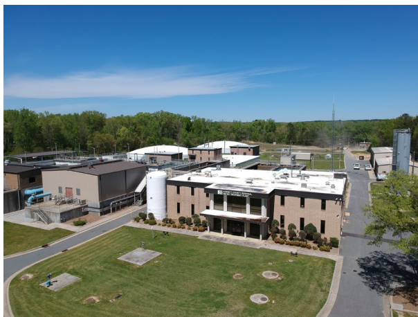
Harnett Regional Water Plant