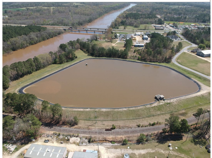
Harnett Regional Water – Water Treatment Plant Reservoir

The Complete SWAP Assessment report for Harnett Regional Water may be viewed on the website: https://www.ncwater.org/?page=600 Note that because SWAP results and reports are periodically updated by the PWS section, the results may differ from the results on the CCR. To obtain a printed copy of this report, please mail a written request to: Source Water Assessment Program - Report Request, 1634 Mail Service Center, Raleigh NC 27699-1634, or email request to swap@ncdenr.gov . Please indicate System Name (Harnett Regional Water) PWSID (03-43-045), and provide your name, mailing address and phone number. If you have any questions about the SWAP report, please contact the Source Water Assessment staff by phone at 919-707-9098.